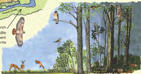
All Illustrations by Robert McNamara of The Art of Wilderness

Zenda Woods has a variety of maple, oak and pine trees. These trees provide important edge habitat, and food for a variety of species including owls. Owl species seen at Zenda include Great Horned Owls, Screech Owls and the endangered arctic Short Eared Owl which is more abundant in years when the meadow vole population is high.