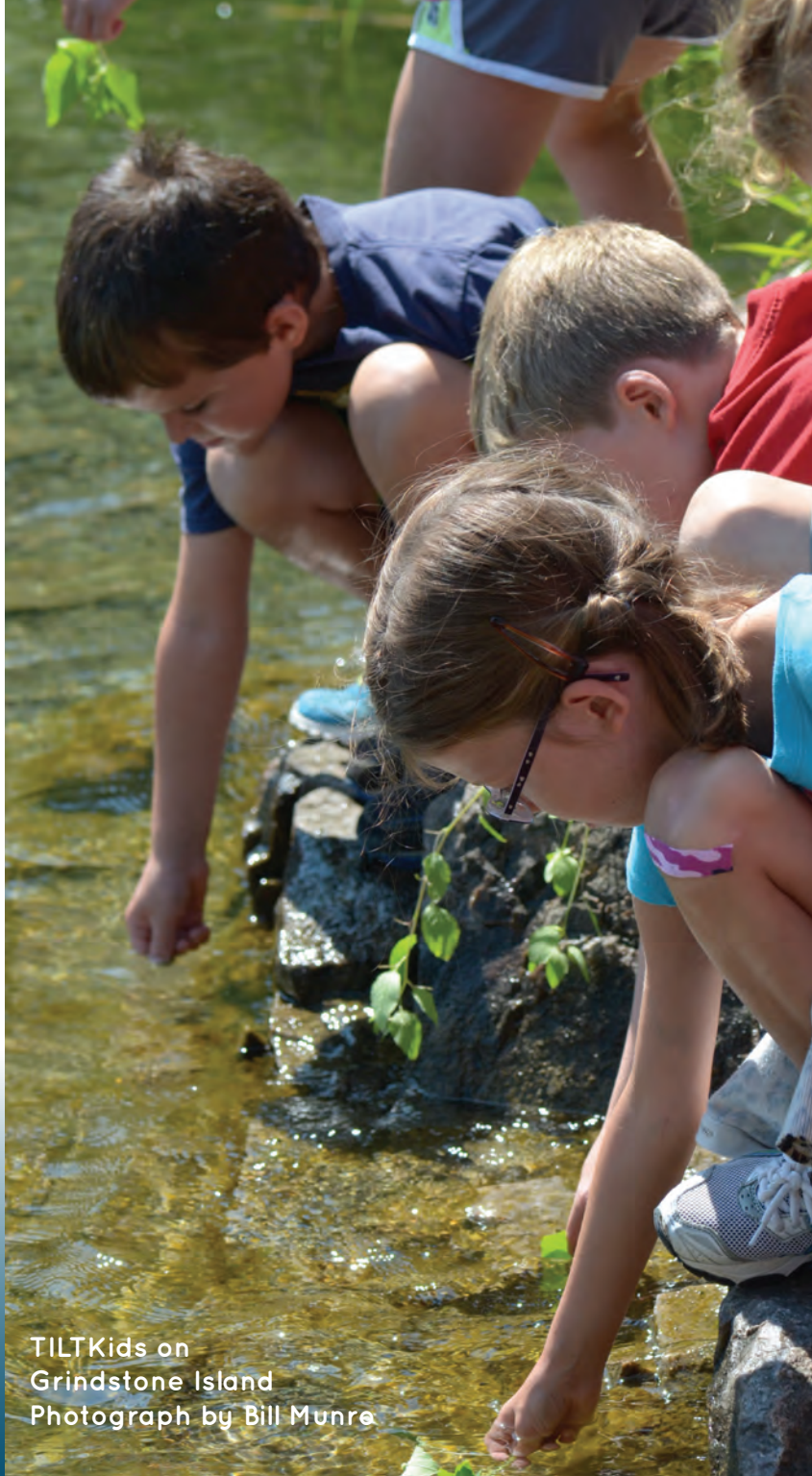
TILTKids on Grindstone Island